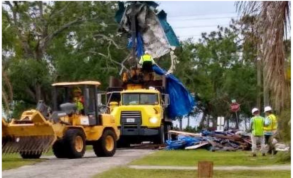
Florida Division of Emergency Management removing Debris on Indiana Drive

The Florida Division of Emergency Management sent crews to pick up constructive and vegetative debris. There is still time to register if you need more debris picked up or DEMOLITION. To apply, visit www.lanDebrisCleanup.com or call 850-961-2002.